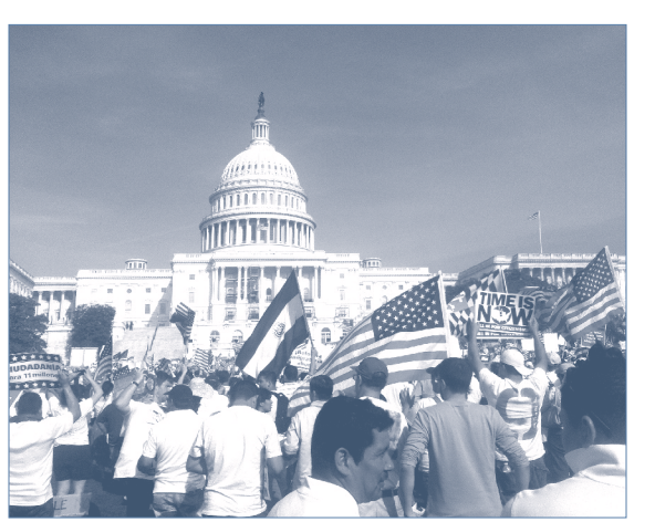
Advocates rally in support of immigration reform in front of the Capitol.

We met with FCC staff and others to ensure that the FCC's E-rate program, which provides telecommunications subsidies for schools and libraries, receives adequate funding. We circulated a letter that a dozen organizations signed on to explaining the program's benefits. In 2014,