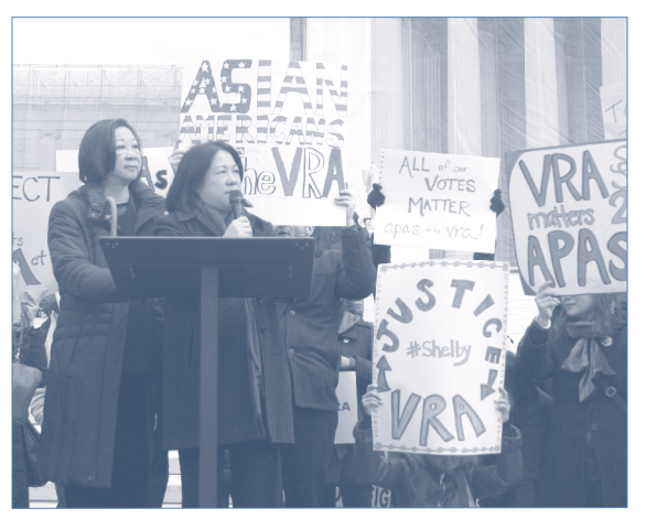
Mee Moua speaks on the steps of the U.S. Supreme Court about the importance of the Voting Rights Act to Asian Americans.

the Obama administration said the federal government would invest $2 billion in connecting and upgrading schools' and libraries' high-speed Internet services.