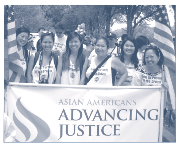
Advocates rally in support of immigration reform in front of the Capitol.