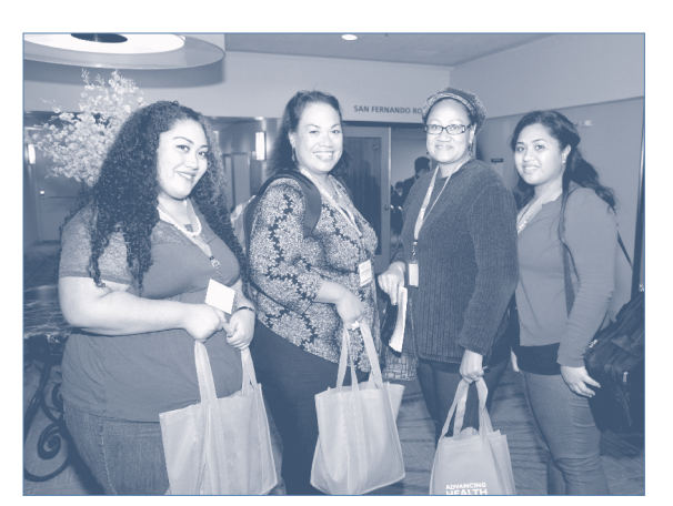
Attendees at the 2013 Advancing Justice Conference in Los Angeles, CA.

In November, council members attended the Advancing Justice Conference , where they ran Advancing Justice | AAJC's immigration photo booth and collected more than 50 stories and photos attesting to the importance of immigration reform for the Asian American community.