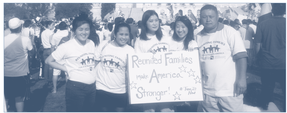
Supporters of the Reuniting Families campaign on Capitol Hill.

Early in the year, Advancing Justice | AAJC launched the Reuniting Families for a Stronger America Campaign to secure common-sense solutions for our family-based immigration system by building support for the Reuniting Families Act. Through community education and political advocacy, the Campaign is pushing for legislative fixes to the inhumane visa-application backlogs, ensuring that family reunification is part of any overall immigration reform.